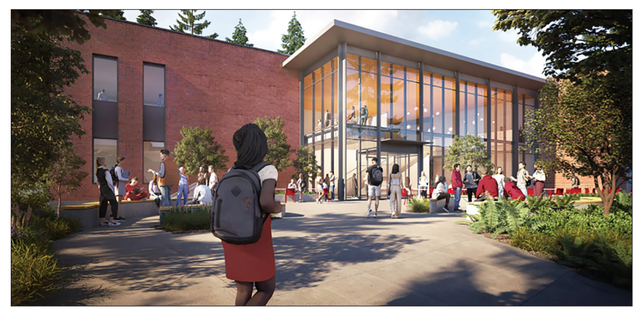
LMN Architects designed the new building.